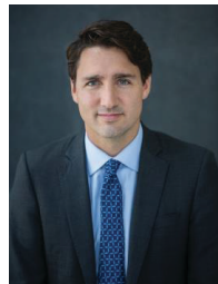
The Rt. Hon. Justin P. J. Trudeau, P.C., M.P. Prime Minister of Canada